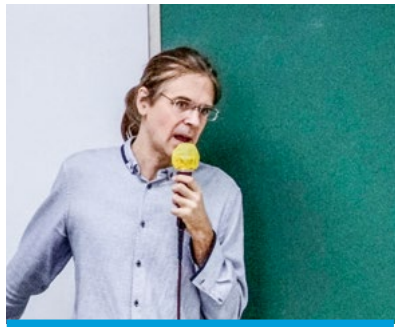
On the evening of June 30, the second English academic lecture of "The 1 st Jingshi Students International Exchange