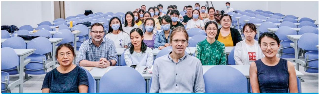
On the evening of July 1, the English academic lecture of "The 1 st Jingshi Students International Exchange Week" — "Bug-Eyed Monster and the Encounter with the Postcolonial Other" — was held at C205, Lijiao Building and also online.